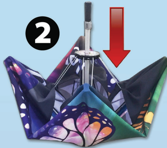
2 Unfold arms while pushing hub down toward table.