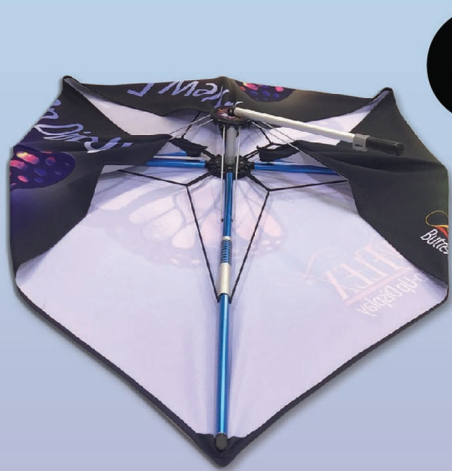
4 Open Arms - Spring loaded slides will lock them in place.