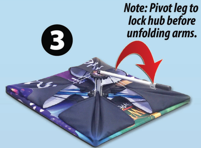
3 Pivot telescoping leg 90° to lock hub in place.