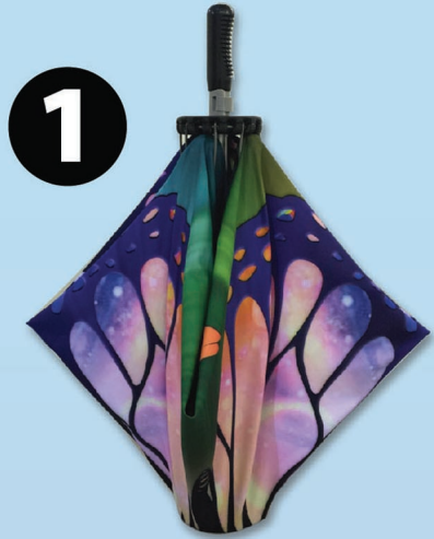
1 Stand ShowFlex tabletop upright on table.